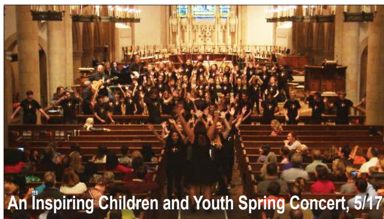
An Inspiring Children and Youth Spring Concert, 5/17

• Stillpoint: The Center for Christian Spirituality has created a new three-day orientation to this ancient ministry. Those who are exploring what spiritual directors do are invited to join us for an enjoyable introduction to this extraordinary work. Thursday–Saturday, June 11–13. "Becoming a Spiritual Director" will be held at Church of Our Saviour, 535 West Roses Road, San Gabriel, California 91755. For more information and to register, go to www.stillpointca.org . Registration is limited and must be received by June 1.