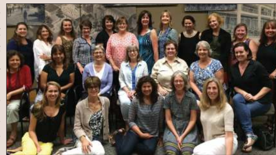
God, My Parents and Me Reunion in 2015