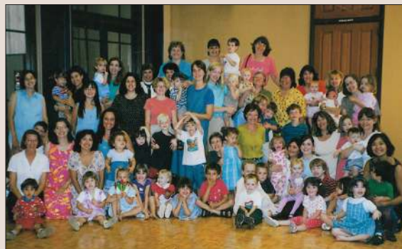
God, My Parents and Me in 2001