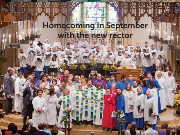
Homecoming in September with the new rector