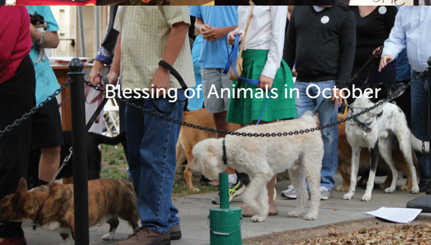
Blessing of Animals in October