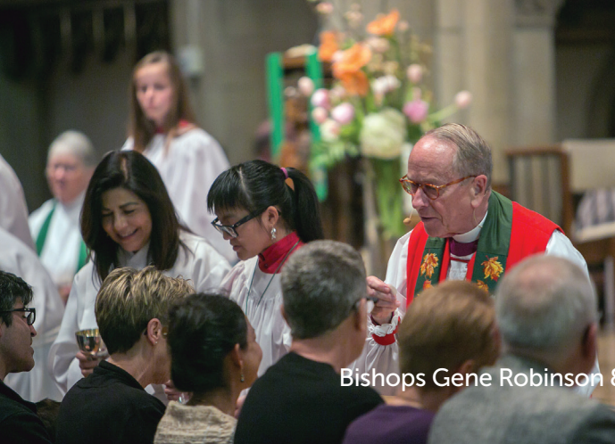
Bishops Gene Robinson & Rob Wright in January