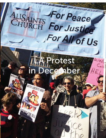
LA Protest in December