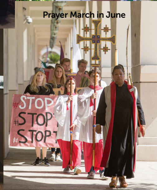
Prayer March in June