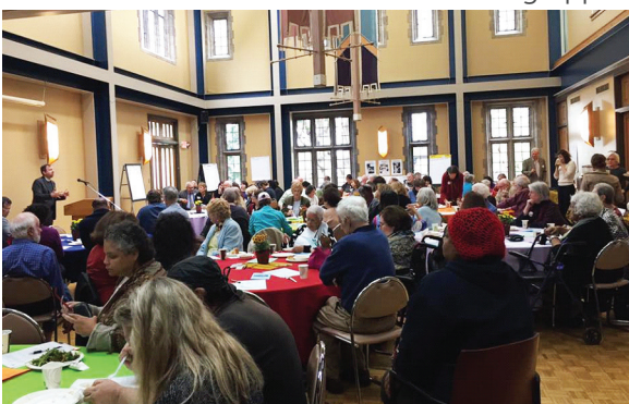
Racial Justice Ministry's Open House