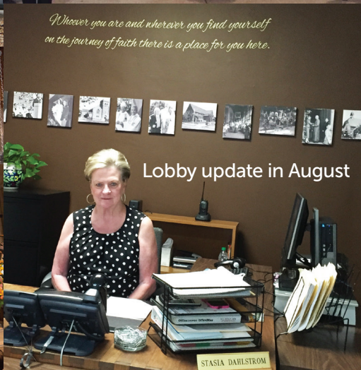
Lobby update in August