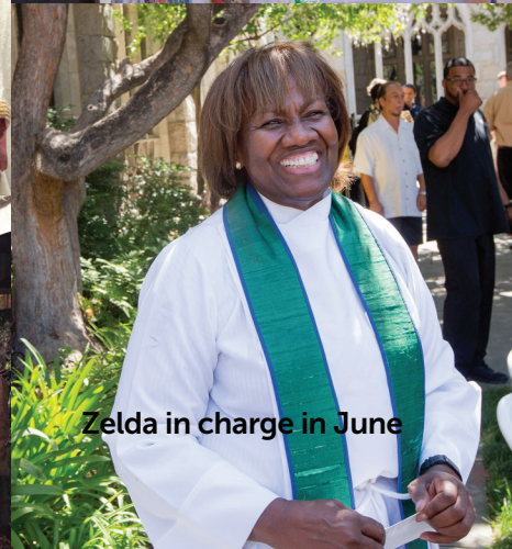
Zelda in charge in June