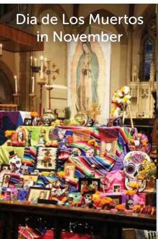
Día de Los Muertos in November