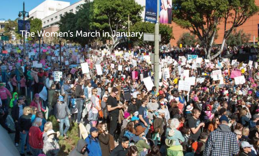
The Women's March in January