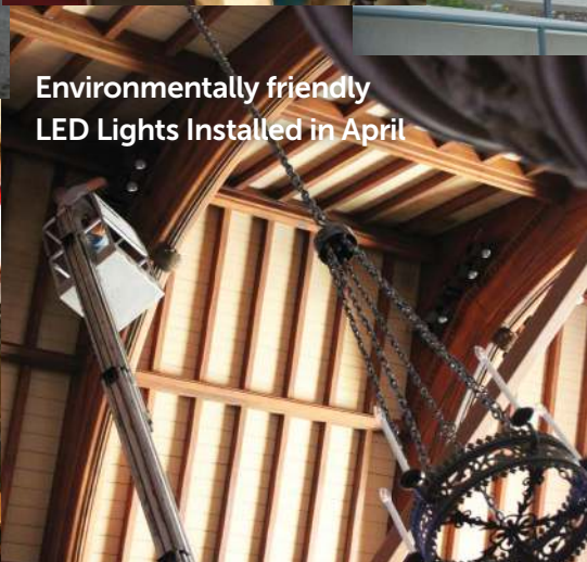
Environmentally friendly LED Lights Installed in April