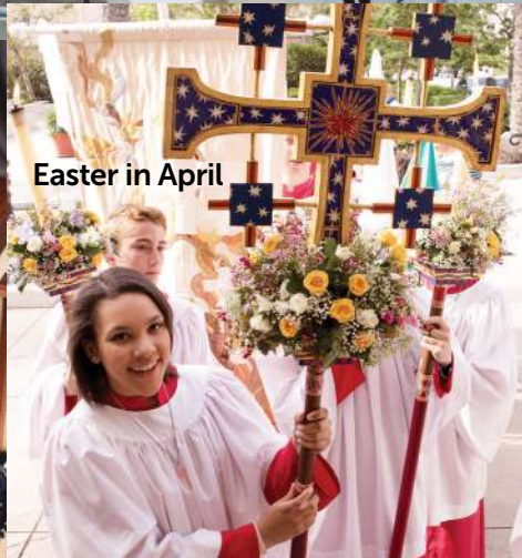
Easter in April