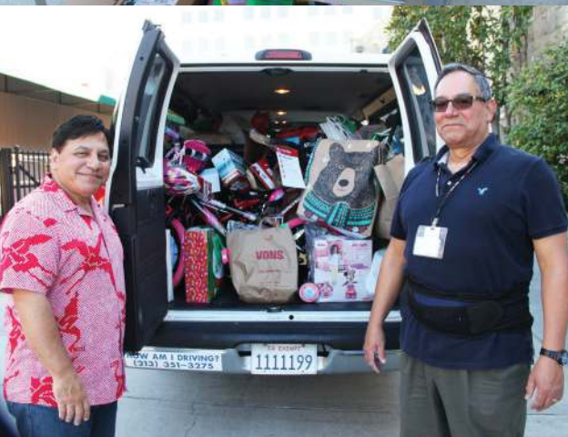
Joy in the loading...

Preparatory School, suggested to her Crestview Council during the 2018 holiday season. Such a simple phrase