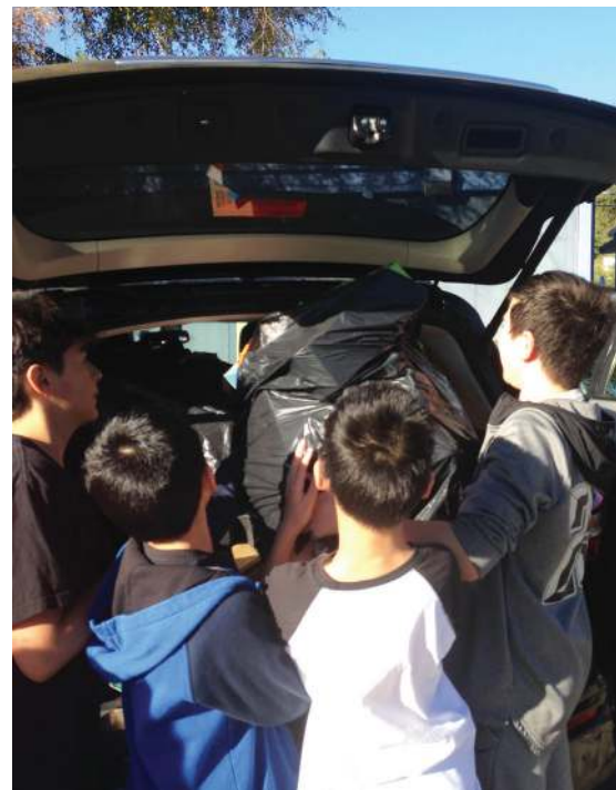
...and the unloading.