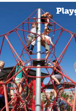
Playground Dedication, 11/9