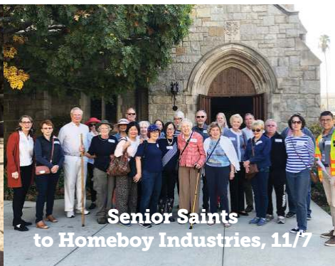
Senior Saints to Homeboy Industries, 11/7