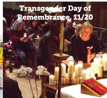
Transgender Day of Remembrance, 11/20