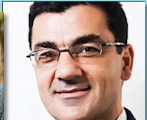
Salam Al-Marayati, Muslim Public Affairs Council