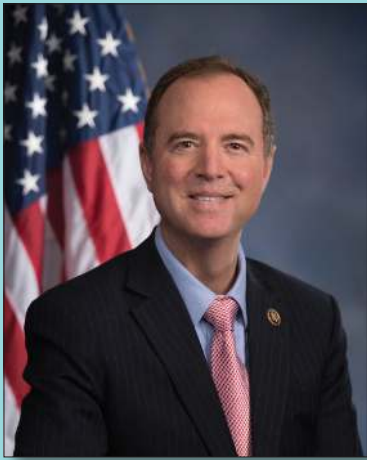
Rep. Adam Schiff, U.S. Congress