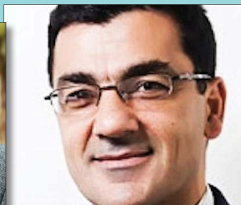
Salam Al-Marayati, Muslim Public Affairs Council