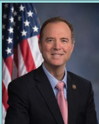
Rep. Adam Schiff, U.S. Congress