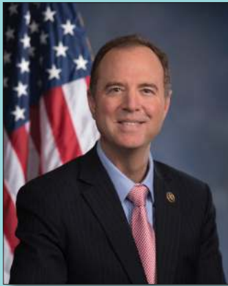
Rep. Adam Schiff, U.S. Congress