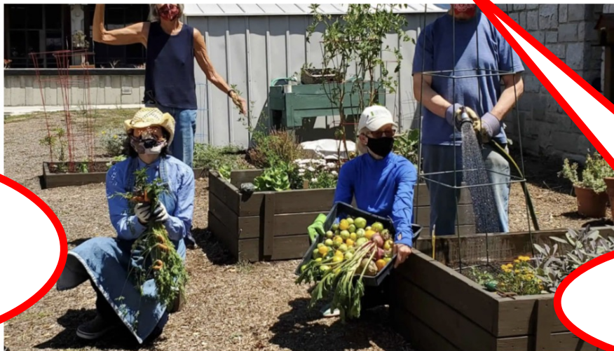
The dedicated worker bees behind the ever-changing All Saints landscape